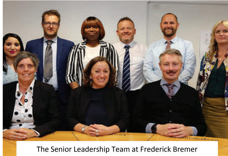
The Senior Leadership Team at Frederick Bremer

Frederick Bremer School is a creative and nurturing school where all staff and pupils are inspired to be 'the very best they can be'. We are judged as a good school across all areas and our SEN provision is outstanding. Our vision and values are central to our practice, and you will need to share our commitment to ensure every pupil is not only academically successful but is also equipped with the skills, qualities and attributes to be a successful 21st century citizen.